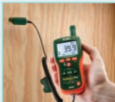
Pin Moisture Probe included for making contact moisture measurements