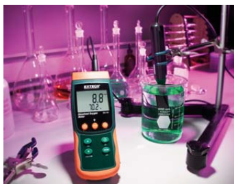
Typical Oxygen measurement applications in lab