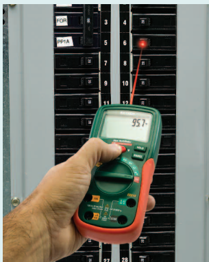
Built-in non-contact IR Thermometer quickly identifies hot spots on electrical panels