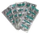
ExTab ® Chlorine Reagent tablets