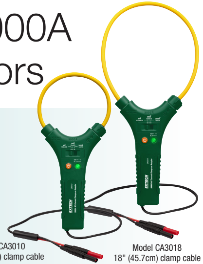
Model CA3010 10" (25.4cm) clamp cable

Expand your meter's capabilities to measure AC Current up to 3000A. Fit most MultiMeters or Clamp Meters with standard shrouded banana plug sockets. Flexible clamp jaw easily wraps around bus bars and cable bundles where standard clamp adaptors and meters can't. The thin 7.5mm cable diameter easily fits into tight spaces. Choose between a 10" (25.4cm) or 18" (45.7cm) clamp cable length.