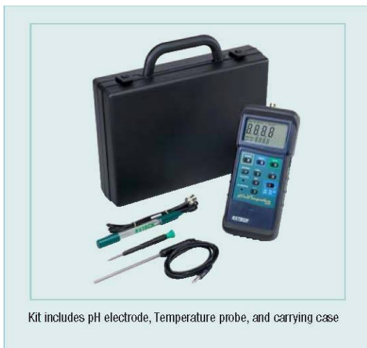
Kit includes pH electrode, Temperature probe, and carrying case