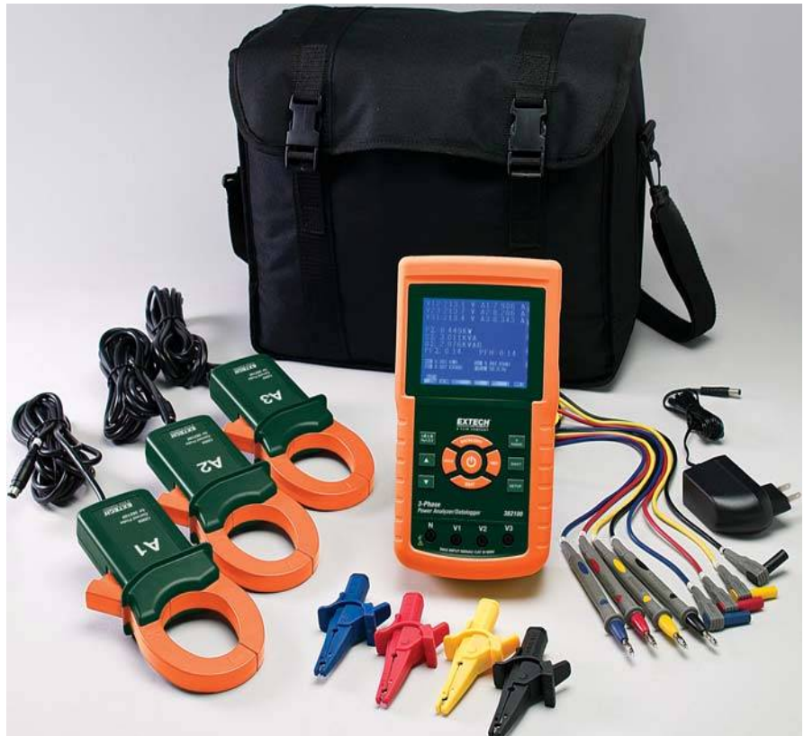
Complete with 3 current clamps, 4 voltage leads with alligator clips, 8 AA batteries, SD memory card, Universal AC adaptor (100 to 240V), and case