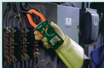
True Power and Phase Indication for enhanced versatility and performance.