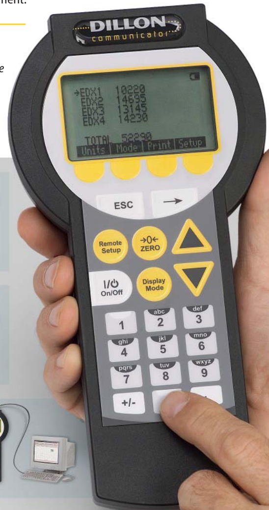
Optional Remote Communicator

A basic stand-alone model can be easily upgraded "in-the-field" to accommodate changing needs. Remote configuration, data acquisition and single point monitoring of multiple links are all possible with the hardwired or radio communication options available with the EDxtreme.