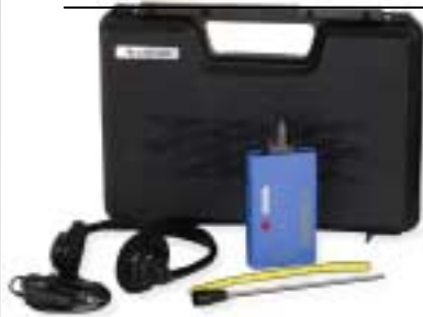
VPE KIT includes VPE meter, headset, waveguide, stainless steel probe and ABS carrying case.

The VPE-1000 includes... Detector, touchprobe & waveguide attachments, comfortable over the ear headset, battery, owner's manual, and instructional CD. All in a hard shell padded case.