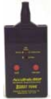
SG2 Sound Generator

AccuTrak Model VPE offers high sensitivity & great sound quality in a compact package designed for one hand operation. Includes flexible waveguide for hard to reach areas, and hard molded carrying case. Important features: Low cost and highly sensitive, Small and simple to use, runs on 9v battery, patented technology, classic heterodyne detector, designed for use in areas of low to moderate background noise.